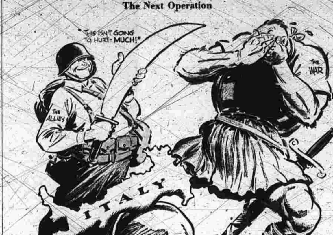
The Next Operation