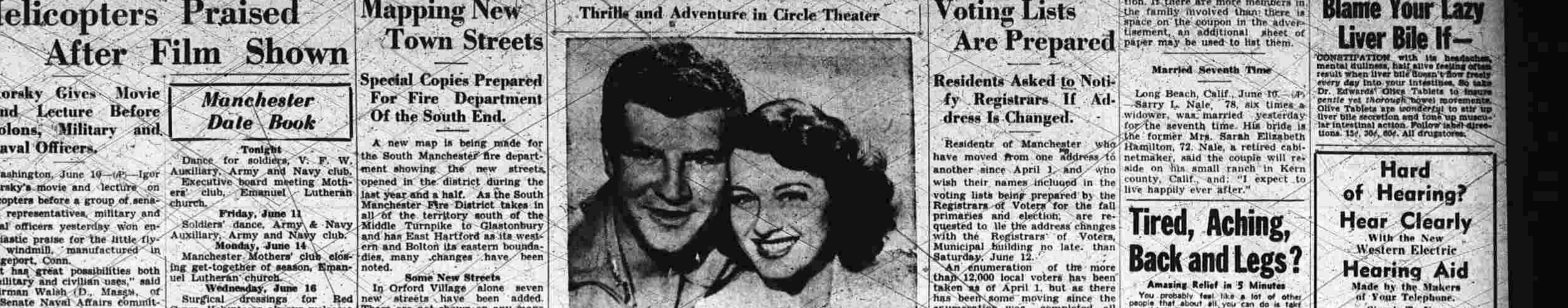
Robert Preston and Ellen Drew, started in 'Night Plane from Chungking'...